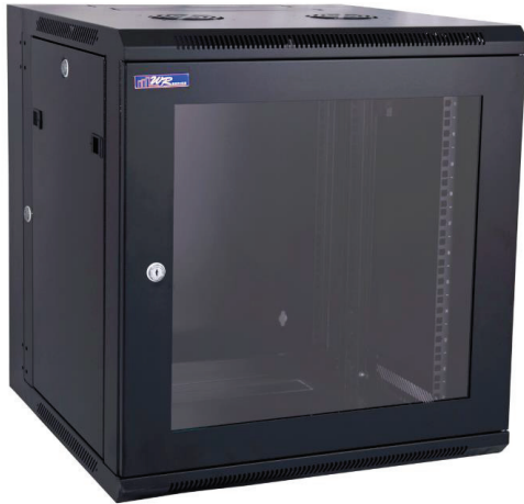
Reference image only